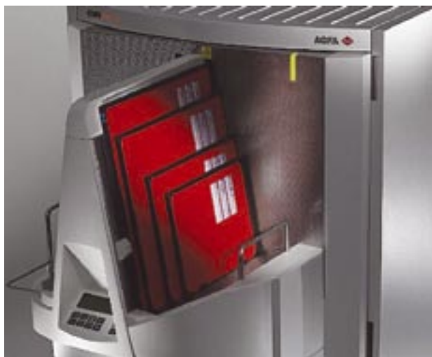
Integrated CR user station for time-saving identification and optimized workflow